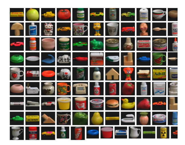
Fig. 2. Sample database consisting of 7200 Images, the database has 100 categories, 72 images in each category.

Fig.2. Shows a sample database of 100 images by randomly selecting one image from each category. The database has 100 categories, and each category consists of 72 images for a total of 7200 images. The image database used in the experiments is the subset of Columbia Object Image Library (COIL-100).